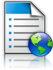
Forms and Favourites

Display Customisation: Display a customised, scrolling slideshow on the colour touch screen to communicate important messages to users while the printer is in Power Saver mode.