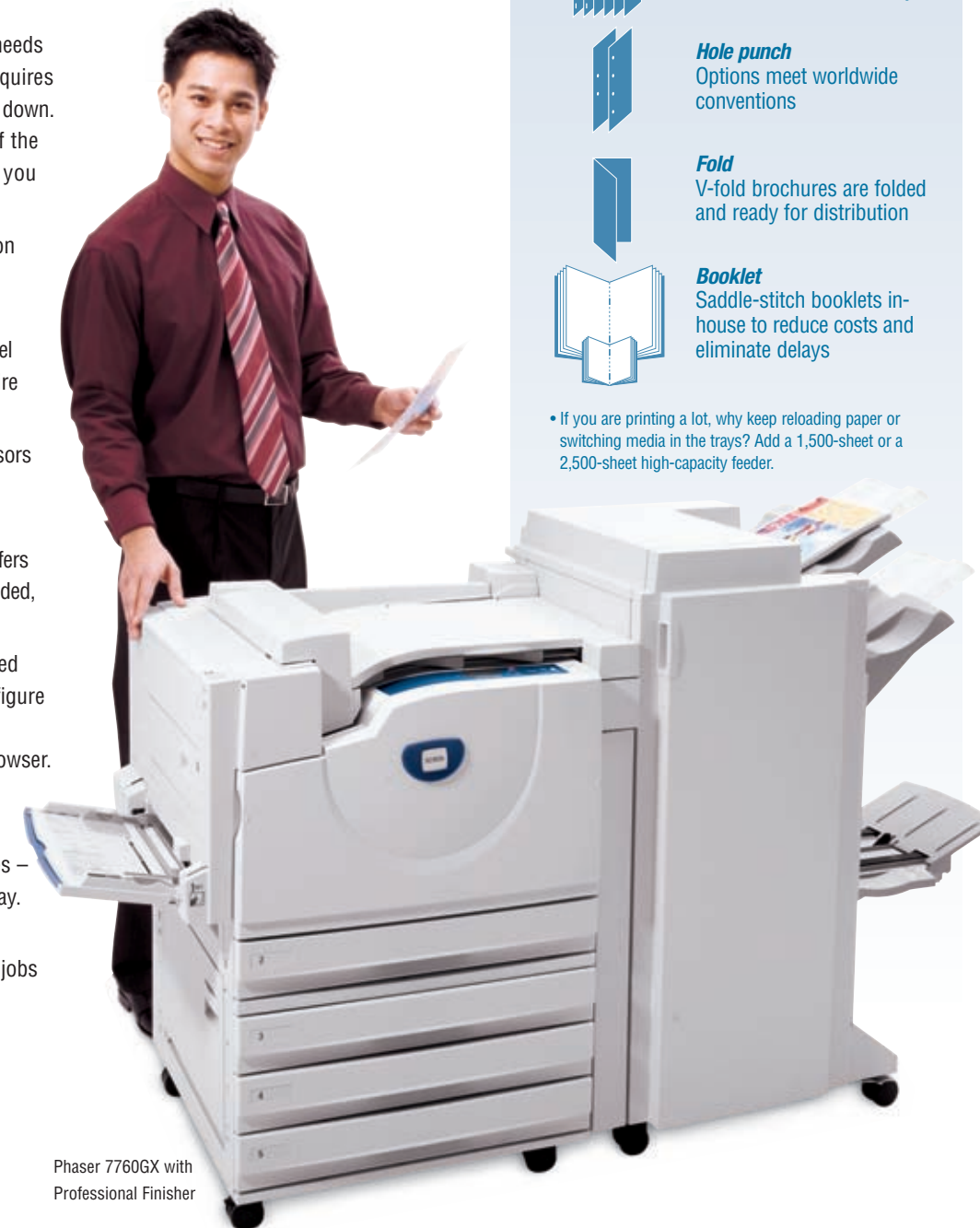
Phaser 7760GX with Professional Finisher