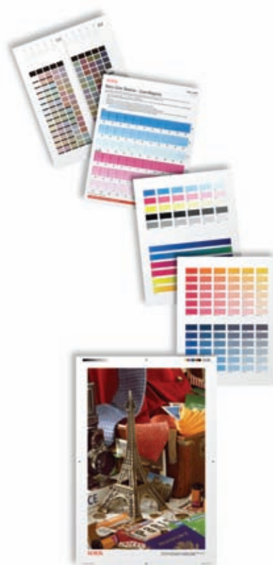
Built in colour calibration tools give you the final output you want.

High-quality, consistent colour is crucial when relying on stunning visuals to convey your ideas and concepts. That's why the Fuji Xerox Phaser 7760 colour printer is the designer's choice. It offers brilliant colour, blazing speeds and easy-to-use features that make the most of everything you print.