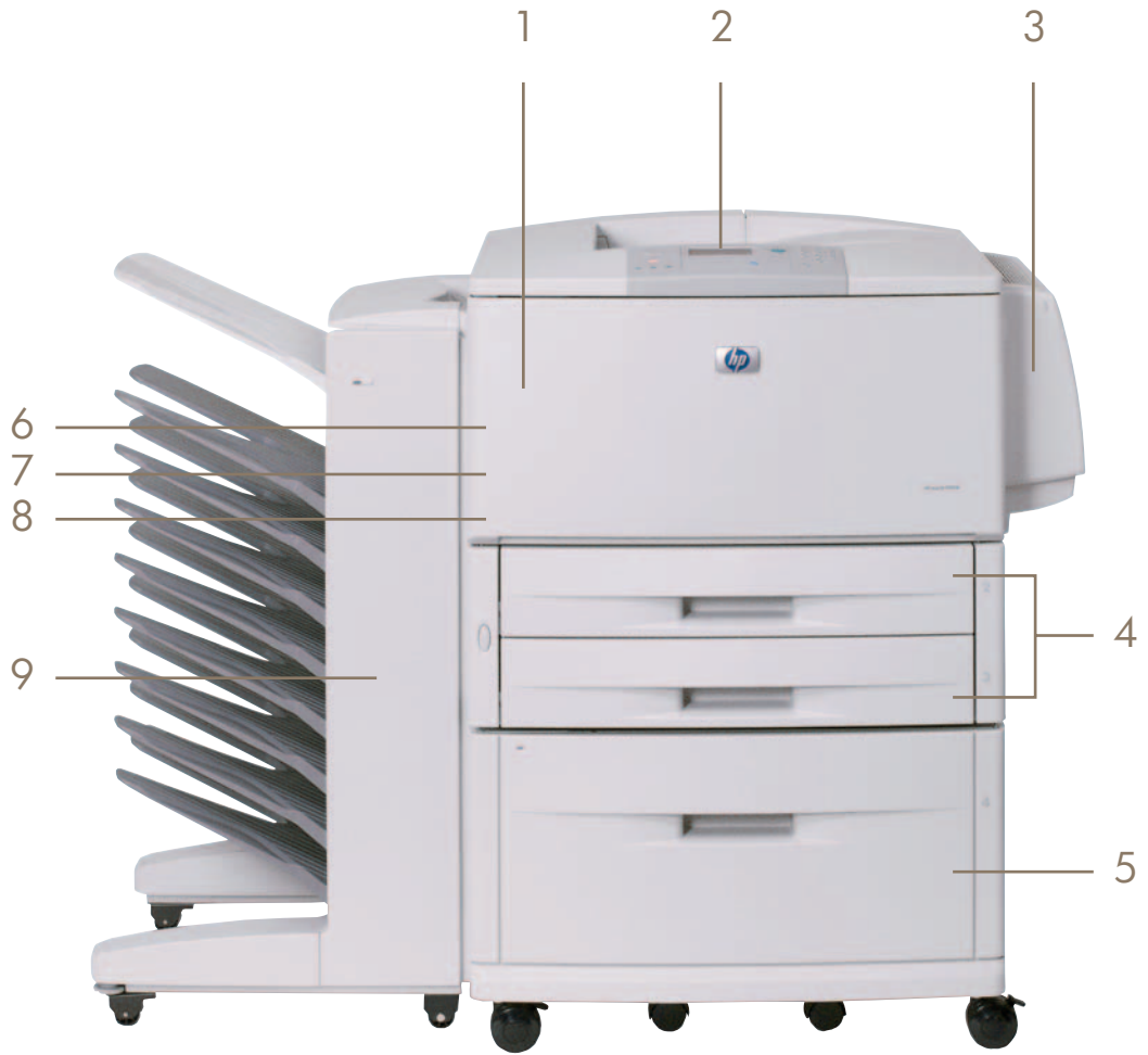
HP LaserJet 9050dn printer shown with optional 2,000-sheet input tray and optional 8-bin mailbox

9. Optional 8-bin mailbox enables automatic document sorting for individuals and departments