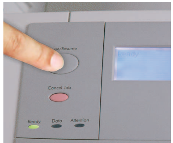
Access sophisticated features and get status information in one convenient location