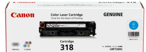
CART318C / M / Y – Cyan / Magenta / Yellow Toner, Yield 2900 pages