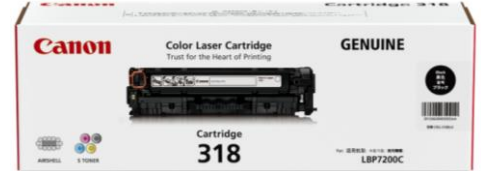
CART318k – Black Toner, Yield 3400 pages

For reliability and continued smooth running of your Canon laser – use genuine Canon Toner