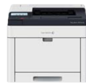
DocuPrint CP315 dw