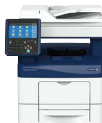
DocuPrint CM415 AP