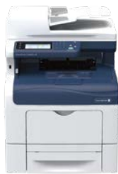
DocuPrint CM405 df