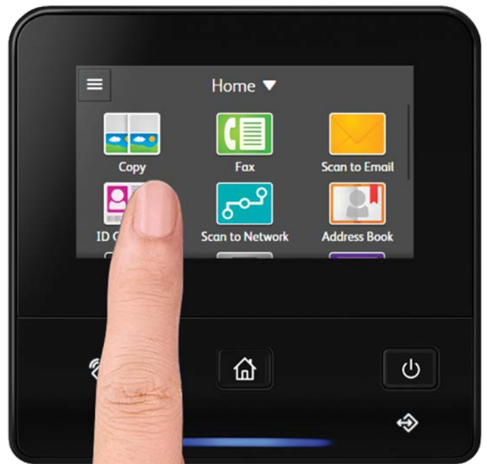
DocuPrint CM315 z 4.3" Colour Touch Screen

The built-in USB port makes walk-up functionality simple, allowing you to print and scan to and from a USB memory stick without the need of a PC.