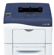
DocuPrint CP405 d