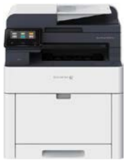
DocuPrint CM315 z