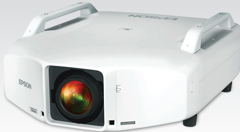
Projector shown with lens. Lens sold separately.