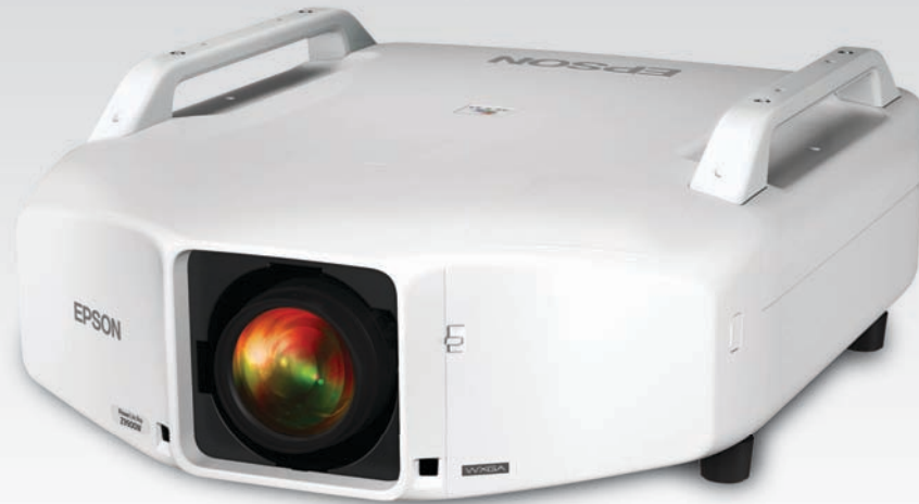
Projector shown with lens. Lens sold separately.