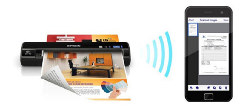
Scan to cloud