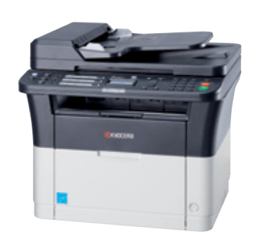
The images displayed in this brochure are for illustrative purposes only, and may include optional extras

KYOCERA Document Solutions Australia Pty. Ltd ABN 77 003 852 444