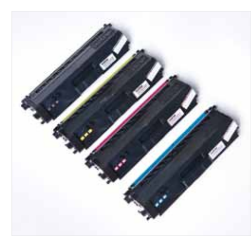
Choice of standard or super high-yield cartridges to perfectly suit your print volume.

You can get more done in the office with the HL-4570CDW's innovative, simple to use solutions that save you time and money.