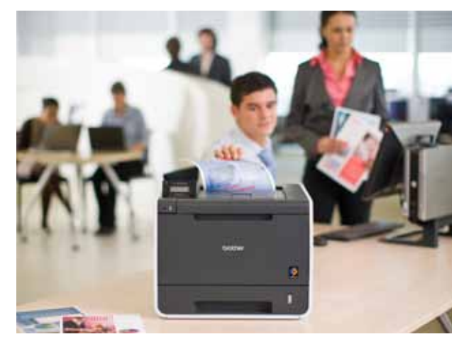
The ideal networked device for your busy office.