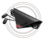
ThinkPad® X1 In-Ear Headphones

Lenovo reserves the right to alter product offerings and specifications at anytime, without notice. Lenovo makes every effort to ensure accuracy of all information but is not liable or responsible for any editorial, photographic or typographic errors. All images are for illustration purposes only. For full Lenovo product, service and warranty specifications visit www.lenovo.com . Trademarks: Lenovo, the Lenovo logo, ThinkPad, ThinkCentre, ThinkStation, ThinkServer and ThinkVision are trademarks or registered trademarks of Lenovo. Microsoft, Windows, and the Windows logo are trademarks, or registered trademarks of Microsoft Corporation in the United States and/or other countries. Intel, the Intel logo, Intel Atom, Intel Core, Intel Inside, the Intel Inside logo, Intel vPro, Intel Xeon Phi, Itanium, Pentium, and Xeon are trademarks of Intel Corporation in the U.S. and/or other countries. Other company, product and service names may be trademarks or service marks of others. © Lenovo 2015. All rights reserved.