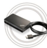
ThinkPad® OneLink+ Dock