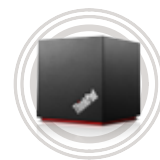
ThinkPad® WiGig Dock