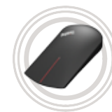
ThinkPad® X1 Wireless Touch Mouse