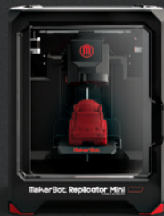
MAKERBOT® REPLICATOR® MINI COMPACT 3D PRINTER makerbot.com/mini