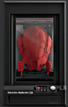
MAKERBOT® REPLICATOR® Z18 3D PRINTER makerbot.com/z18