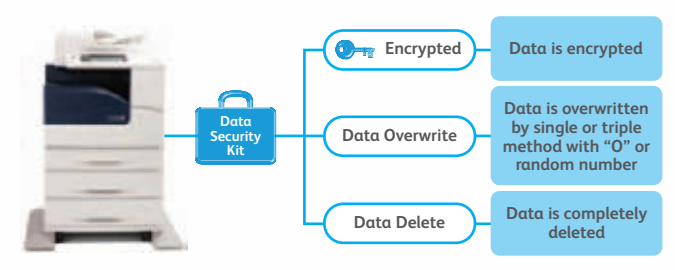
*Optional DocuPrint CM500 Series Upgrade Kit is required.

Network Authentication – Restricts access to device features and management settings by validating user names and passwords.