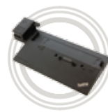
ThinkPad® Professional Backpack