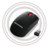
ThinkPad® Optical Wireless Mouse

LENOVOPARTNERNETWORK.COM LENOVOPARTNERNETWORK.COM/CA