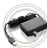
Lenovo® 65W Travel AC Adapter