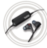
ThinkPad® Noise-cancelling Earbuds